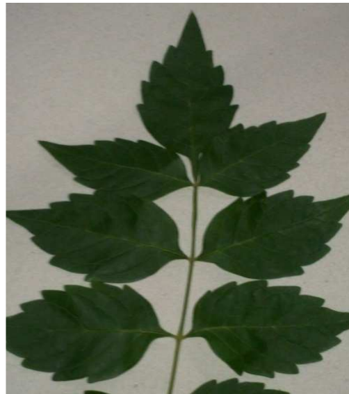
Figure 6: Leaves of Tecomaria capensis