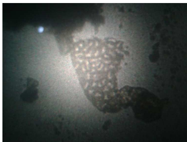
Figure 4: Spongy parenchyma cells