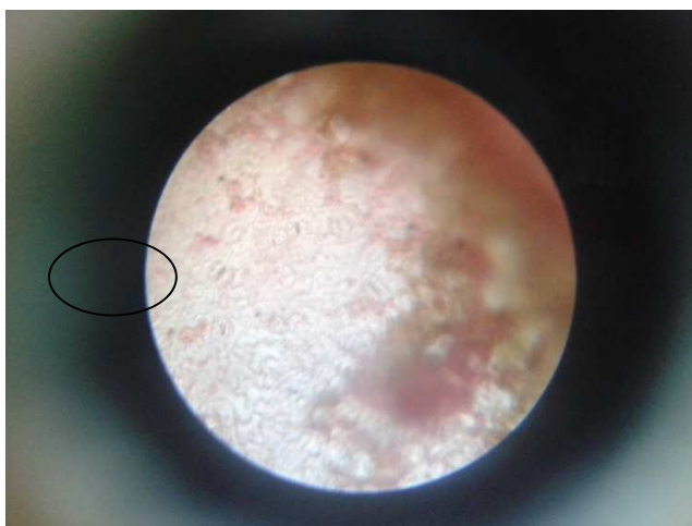
Figure1: Anamocytic stomata

It is of single layer non-lignified rectangular shape of cells arranged transversally