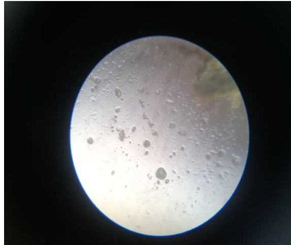
Figure 2: Clusters of calcium oxalate crystals