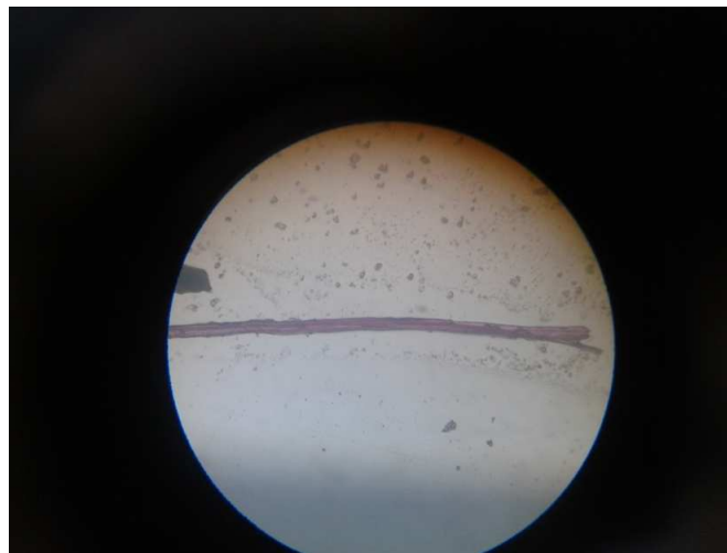
Figure 3: Phloem vessels