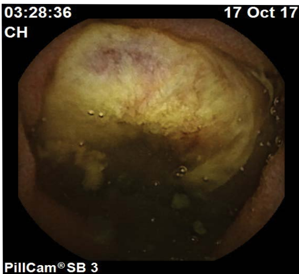
Figure 1 Jejunal tumor diagnosed by capsule endoscopy.

Etiopathology of small bowel adenocarcinomas is similar to colorectal adenocarcinoma. The high rate of replacement of the cells of small bowel (approximately 4 to 7 days) does not allow to accumulate mutated cells, in addition immunoglobulins IgA play an important role in immune function. However, despite these features, they still present the sequence adenoma-carcinoma found in colorectal carcinomas, although they have a lower incidence of mutation in gen APC [3,9,10].