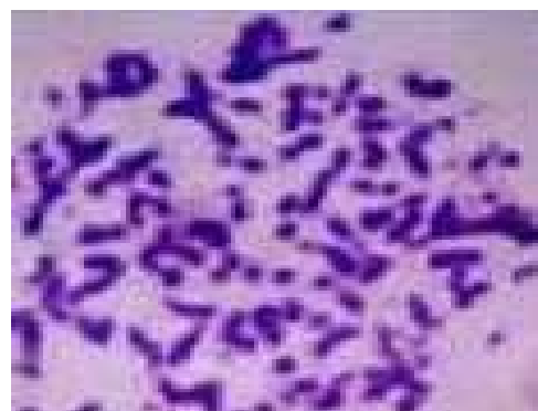
B. DMBA treated (abnormal chromosomes)