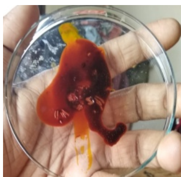
Figure 2: Extracted curcumin.