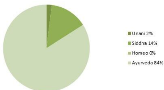
Global Herbal Market(Plant Science)

The world trade in medicinal plants is estimated to be about US$62 billion, with the major players being the European Union at 45%, Asia 17%, and Japan 16%. Some of these medicines are also exported to the Middle East. Major destination countries are the USA, Japan, Nepal, Sri Lanka, Germany, Italy, Nigeria, and the UAE.