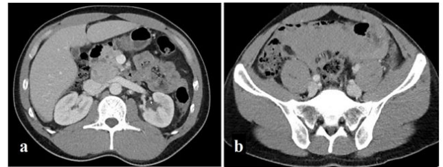
Figure 1 a) CT-6.8 × 4.0 × 3.0 cm paraganglioma in right upper abdomen, anterior to inferior vena cava and posterior to head of pancreas b) CT-6.5 × 5.0 × 3.5 cm heterogeneous pelvic mass with calcifications (GIST).

characterized by concurrent paraganglioma and GIST resulting from a mutation in the SDH gene, was suspected [10]. The patient's family history of cancer is significant: his mother has a personal history of ovarian cancer diagnosed at age 53 and an extended maternal family history of early-onset breast cancer.