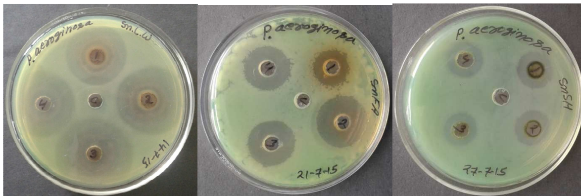
Fig - 02: Effect of (a) water extract of leaves (b) acetone extract of fruits and (c) hexane extract of stems of Solanum nigrum L. on Pseudomonas aeruginosa

Among the different types of extracts of S. nigrum leaves, water extract at 50 mg/ml concentration showed maximum ( 21.30 \pm 1.50 mm) zone of inhibition against P. aeruginosa . There is no zone of inhibition observed in negative control (DMSO having no extract) in all cases. The activities of two antibiotics (Streptomycine and Ciprofloxacin) were also observed against E. coli , S. typhimurium and P. aeruginosa (Fig. – 02a and Table- 07).