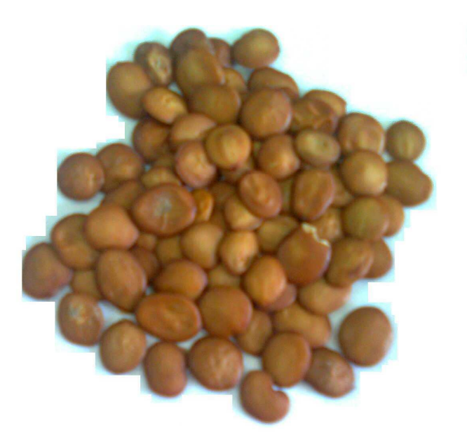
Fig. 2. Pithecellobium monadelphum seed