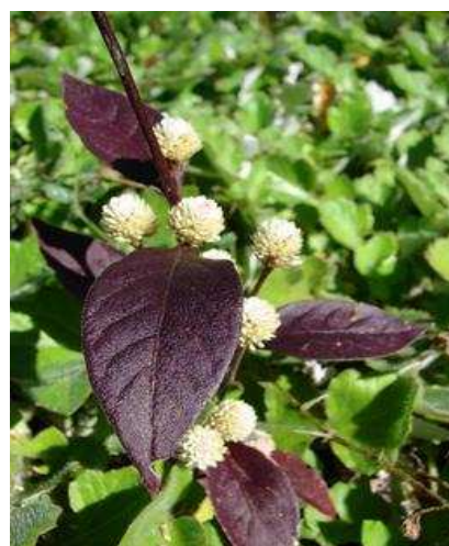
Figure 1: Leaves & Flowers of Alternanthera brasiliana