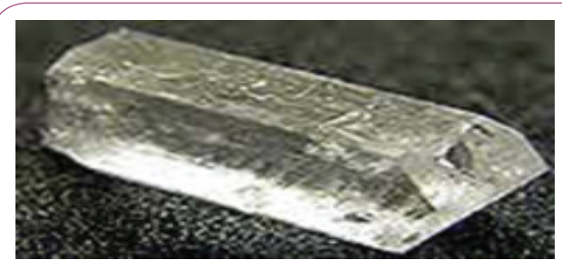
Figure 1b Epsom salt composed of small, colorless crystals looking like table salt.