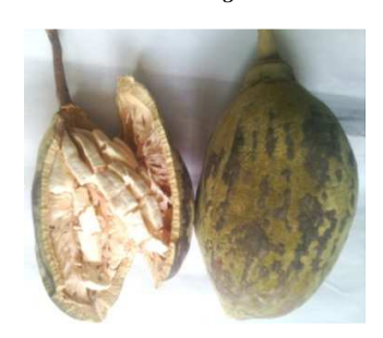
FIGURE 2: A. digitata Fruit