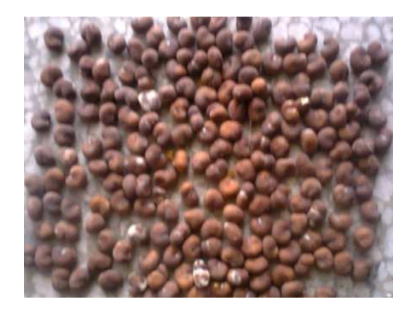
FIGURE 2: A. digitata seeds