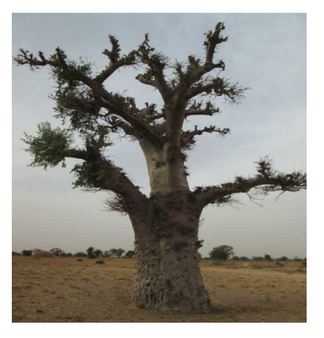
FIGURE 1: A. digitata Tree

The aim of this paper is to determine some nutraceutical properties of Adansonia digitata seeds such as proximate analysis, elemental analysis as well as physicochemical characterization and anti oxidant capacity of the seed oil.