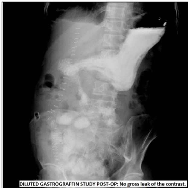
Figure 1: Diluted gastrograffin study post-operative: No gross leak of the contrast.

found in peritoneal cavity, no perforation noted at the anterior wall of the stomach or duodenum. Duodenum and retroperitoneal structures were looking unhealthy so the lesser sac opened and Kocherization of duodenum was performed. Large amount of foul smelling pus was revealed in the retroperitoneum along with necrotic slough and adhesions. There was a large perforation located on the posterior wall of the first part of the duodenum, and the entire lateral and posterior walls were badly scarred, calloused, inflamed and distorted. After adequate irrigation with warm normal saline, the perforation was repaired using an omental patch fixed with 3/0 PDS sutures. Retro-colic loop gastrojejunostomy was fashioned using GIA 60 side-side stapled anastomosis and a feeding tube jejunostomy was inserted 25 cm from the DJ flexure. Two abdominal drains were placed both in the lesser sac and pelvic cavity. The inflammation and scarring of the region was a major contribution to the decision not to perform any resection procedures as in the presence of purulent peritonitis any definitive and prolonged procedure would have done more harm than good so only damage control surgery was done and it was kept in mind that there are high chances of leak of Graham's patch and in case of any leak the patient will be managed conservatively.