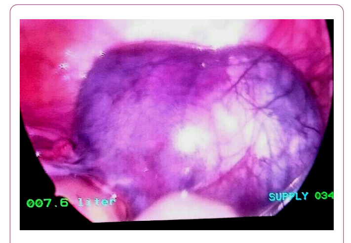
Figure 2 Laparoscopic picture of twisted gangrenous Para ovarian cyst.

Laparoscopy was done through one umbilical 10 mm. incision and two side incisions 10 and 5 mm. in size. Laparoscopy revealed torsion and gangrene in the Para ovarian cyst (Figure 2).