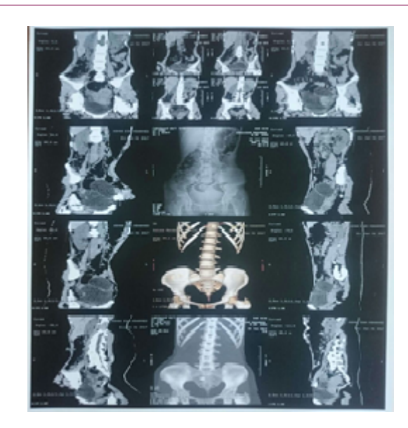
Figure 1 C.T. scan showing the adnexal mass.

A seventeen years old girl presented to the emergency department of our hospital complaining of acute abdominal pain for 8 hours. On Examination her pulse was 120 beats per minute, blood pressure 100/60 and temperature was 37.8 Celsius, abdominal examination revealed lower abdominal tenderness and rebound tenderness. Laboratory investigations revealed leucocytosis. She was initially diagnosed as acute appendicitis and C.T. scan was arranged which revealed a large adnexal mass 82 \times 63 mm (Figure 1).