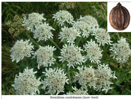
Heracleum candolleianum (Inset- Seed)