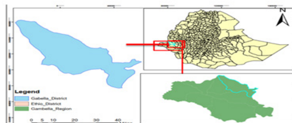
Figure 1: Study area map.

The experiment is performed in the Gambella district using rain-fed conduction during the 2020 growing season. The area is suitable in Ethiopia's Gambella region, which is located at an elevation of 840 m.a.s.l., at latitudes 8° 23'N and 34° 44'E, and at those coordinates [8,9]. The district's average minimum and maximum temperatures typically range between 25°C and 42°C, respectively. During the months of February and March, the temperature in this region is extremely hot, reaching 42°C–45°C. The annual rainfall average is between 900 mm–920 mm (Figure 1).