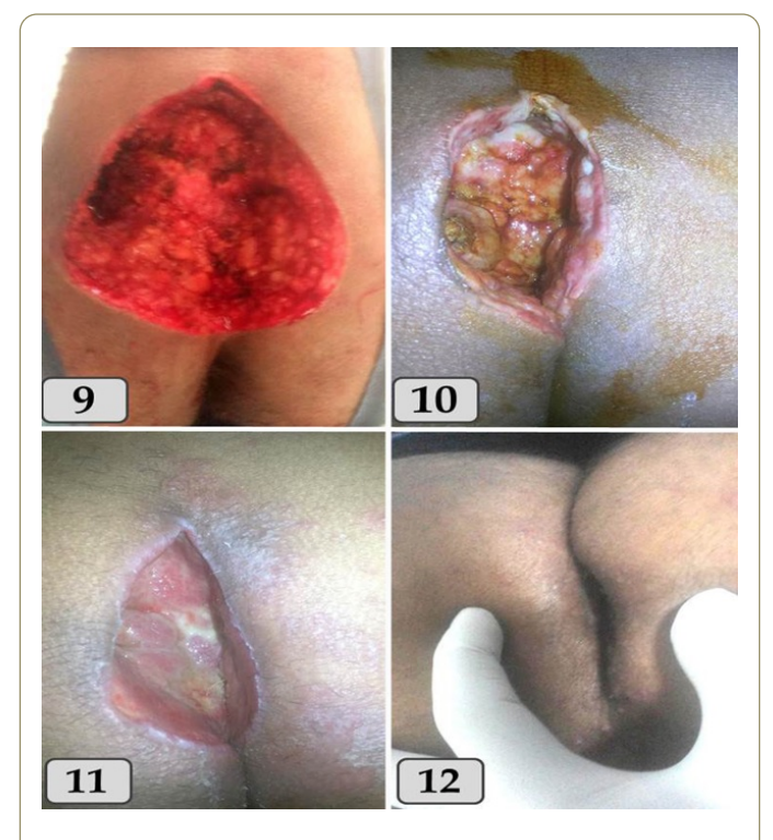
Figure 3: Wound healing described in Plate 9, 10, 11, 12. Plate 9: (Wound after surgical excision of sacrococcygeal pilonidal sinus) showing lay open the wound. Plate 10: (Lay open wound after excision of sacrococcygeal pilonidal sinus after one week on daily wound dressing with bee honey) showing early and rapid granulation tissue formations. Plate 11: (Lay open wound after excision of sacrococcygeal pilonidal sinus after two weeks on daily wound dressing with bee honey) showing clean wound with excellent granulation tissue formation. Plate 12: (Lay open wound after excision of sacrococcygeal pilonidal sinus after five weeks on daily wound dressing with bee honey) showing complete wound healing.

Moreover, Medhi et al. [19] concluded that application of honey has significant efficacy in treatment of wounds as it demonstrated in observational studies but in controlled clinical studies observed, its modest efficacy, so clinicians and researchers should look for clinical evidence and more randomized double blind trials that will provide the scientific evidence to support the use of honey in wound healing management. So base on above observations it can be concluded that topical application of honey is very useful for the treatment for wound healing.