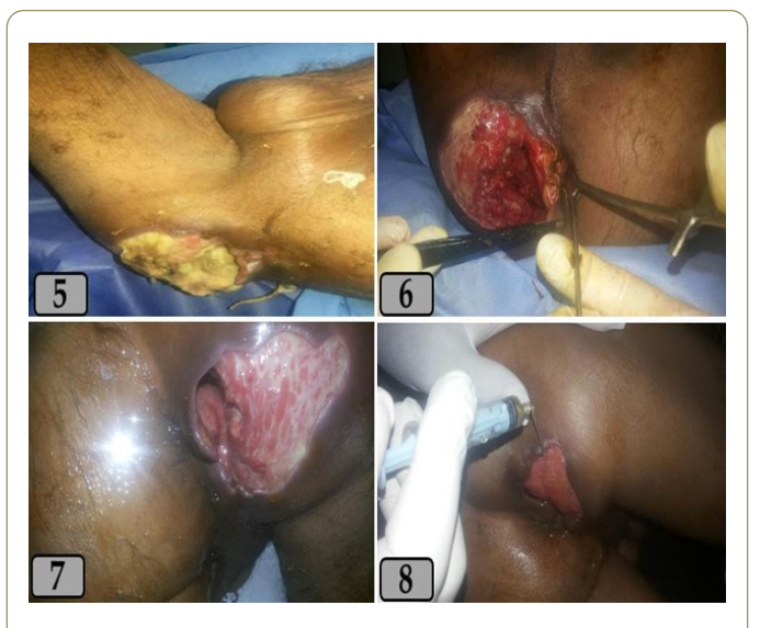
Figure 2: Wound healing described in Plate 5, 6, 7, 8. Plate 5: (Perianal infected wound before surgical drainage and debridement) showing severe wound infection. Plate 6: (Perianal infected wound intraoperative surgical drainage and debridement) showing the wound after surgical drainage and excision of dead tissue. Plate 7: (Perianal infected wound one week after local treatment with honey) showing starting the healing process and wound cleaning. Plate 8: (Perianal infected wound two weeks after local treatment with honey) showing rapid wound healing and cleaning.

In group B, povidone iodine local wound treatment, wound healing and closure from 2 weeks to 8 weeks, except 4 cases of diabetic foot wounds, two from them needed another local drainage and debridement under general anesthesia after 2 weeks from the first drainage and needed about 4 to 6 weeks for wound healing from the second drainage and another two cases changed to chronic wound and complete healing after about 3 months from the second wound drainage and debridement.