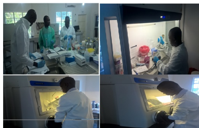
Figure 2 Plates A-C (Pictures highlighting training activities).

In keeping with the activities for staff capacity strengthening, training has been accomplished by experts from Noguchi Memorial Institute for Medical Research (NMIMR), University of Ghana on Bio-safety, Bio-security and Good Laboratory Practices from 1-12 February 2016. This was followed by initial analytical training by the same experts in Eliza and PCR for Ebola, Lassa fever, Rift Valley Fever, rabies and Influenza A and B from 26 September-6 October 2016 and follow training on 26 February-8 March 2017 (Plates A-C). Simultaneously, Laboratory Quality Management (LQM) training from 10-14 October 2016 and a follow up training for the development of standard operating procedures (SOPs) from 9-13 January 2017. Reports of these training activities are available as part of the laboratory documentations (Figure 2).