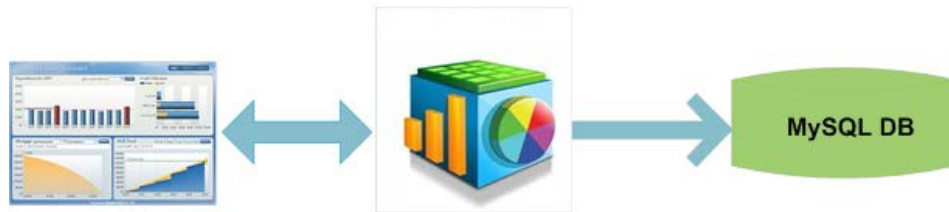
Figure 2: System Architecture