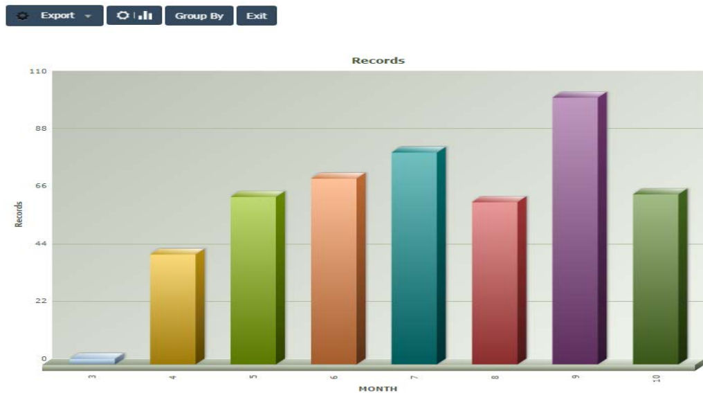
Figure 3: Chat view of the KPI Total Orders