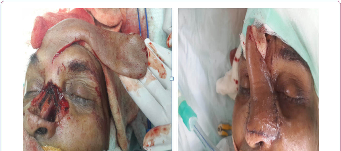
Figure 2: Extended paramedian forehead flap elevation and inseting of folded extended paramedian forehead flap.