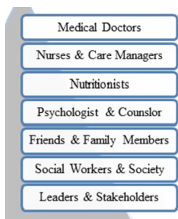
Figure 3: Multidisciplinary team 'or' care management.