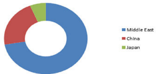
Laboratories with CPA Accreditation

Pathology Market is one of the Fastest Growing Segment in Japan across the world.