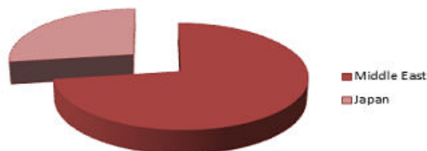
Pathology market in 2018-2022

The report gives you detailed graphical information about study in different market segments of industry. The key role is to adopt sustainable strategies such as new product development, distribution of equipments, regional channel expansion and also to attain a greater share target in the market.