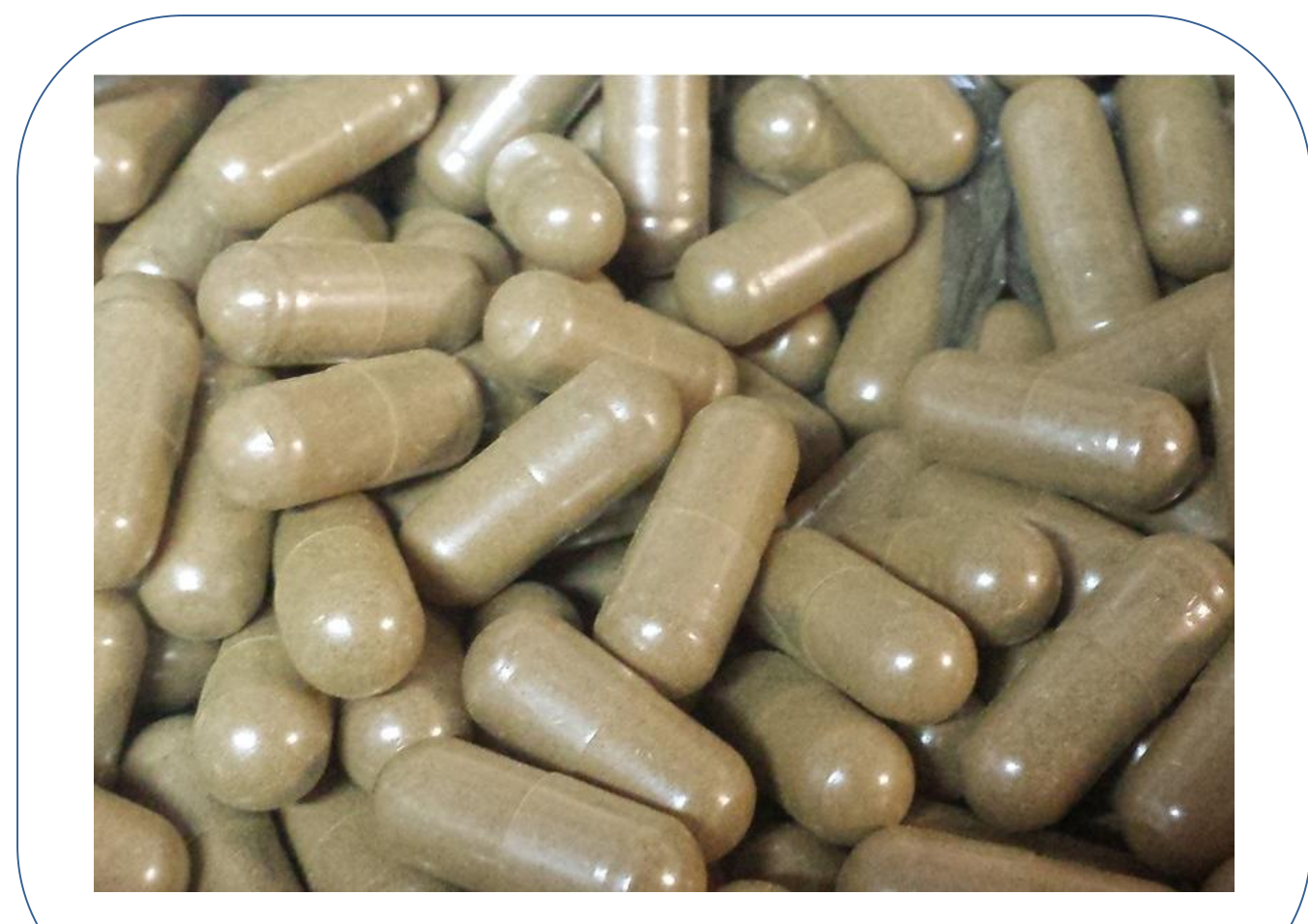
Figure 2. Encapsulated powdered leaves of Artemisia annua L. (IFBV-BELHERB)