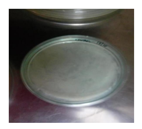
Figure 2: Spread plate of Lactobacillus acidophilus

Nutrient media thus prepared was sterilized by autoclaving at 121°c for 20mins at 15 lbs pressure.