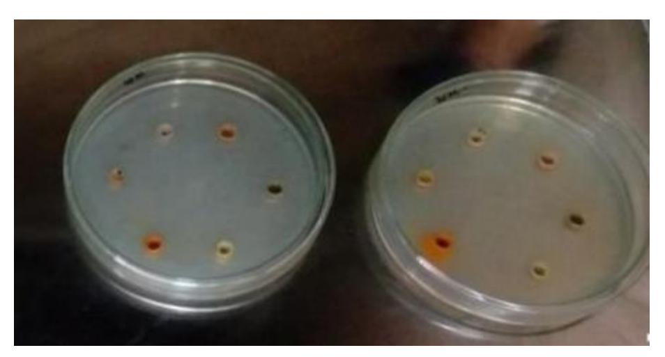
Figure 5: Plates showing the inhibition zones against the organisms at concentrations 20µl and 30µl