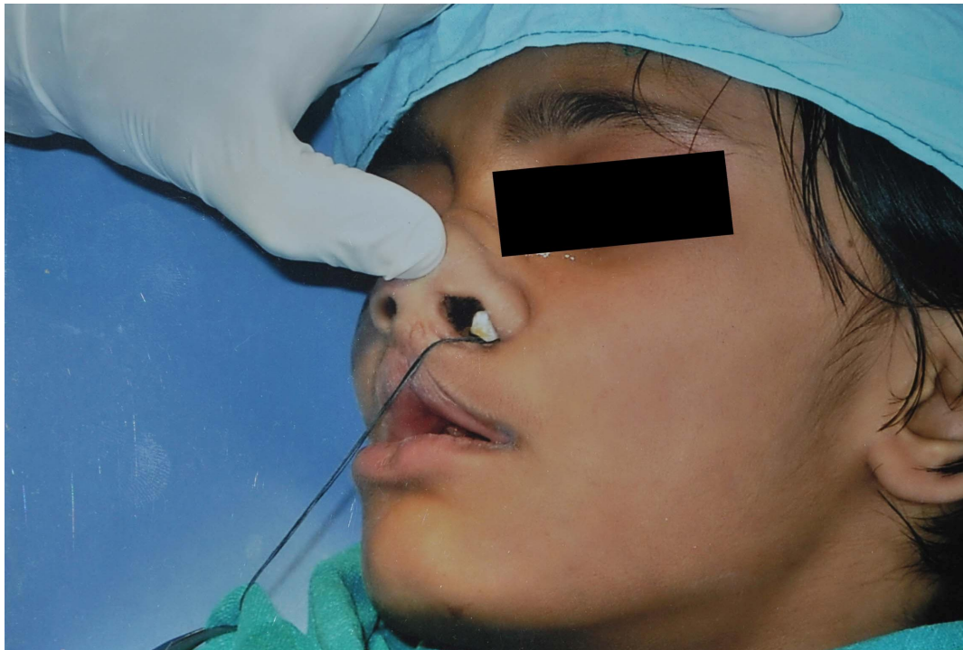
Figure 3: Pre extraction procedure