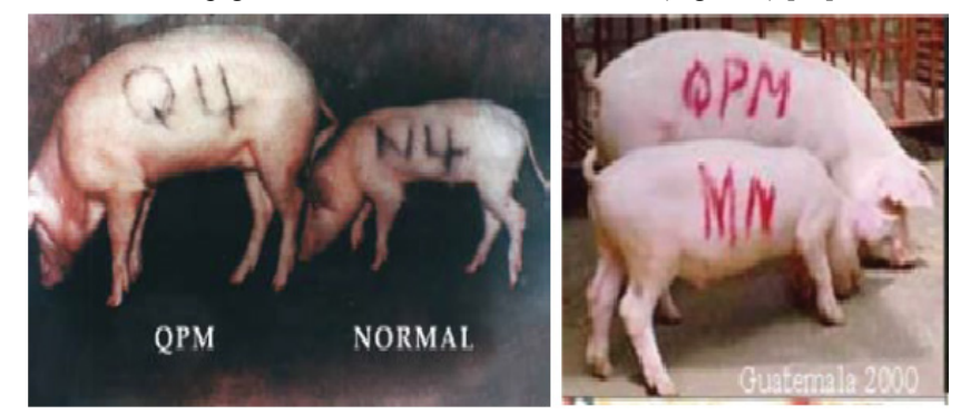
Figure 2: Pig fed high lysine/tryptophan maize (bigger animal tagged Q4) contrasted with its sisterly provide for normal maize (designated as N4).

The previous study which was conducted on pigs reveald that animal nutrition tested high lysine or trptophan weight at unevenly double the degree of live stock fed only on normal maize with out extra protein supliments. As the report directed that later 60 days, 14 pigs fed HQ-61 suplimented through a high lysine/tryptophan maize, weighed 18 kg over those suplimented QPM than pigs fed normal maize as indicated in (Figure 2) [51].