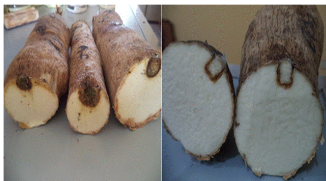
Figure 2 Pathogenicity test showing rot caused by A. flavus and pathogenicity test control showing no rot.