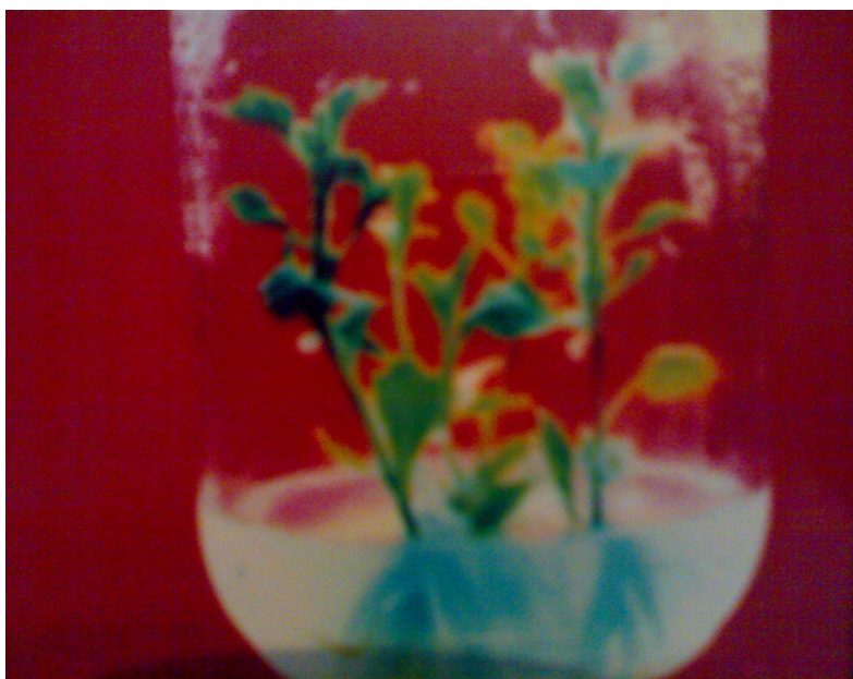
Figure 1: In vitro rooting

* Supplimented with 60 g/l sucrose and Values in parenthesis indicate arc sin transformed.