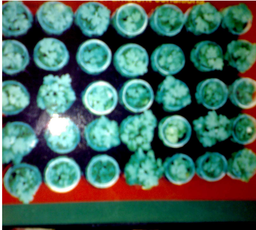
Figure 3: Plants ready to transfer under ambient conditions.