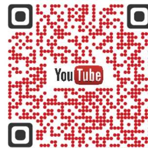
Figure 3 “The day of the Glass 2: An illustrated version. The story behind the corning vision” QR code link.

The MR can also be used in medical distance education, such as distal surgical knife training, cancer therapy and nursing education training [21], doctors and trainees in different spaces (hospitals), both sides wear MR glasses, you can immediately see the distal picture, the doctor Simultaneously sees the trainee simulates the surgical operation training situation, directs the teaching, may inform the other side to give the feedback at any time, the future may also combine to X ray, CT, MRI, angiography and Doppler ultrasound. Describing the Corning high-tech glass combination that will help and change our world in the future, 6:20 to 8:35 in “Glass Day 2: An Illustrated Version. The Story Behind Corning Vision” to describe the future in medical applications ( https://goo.gl/sfGiQy ) (Figure 3).