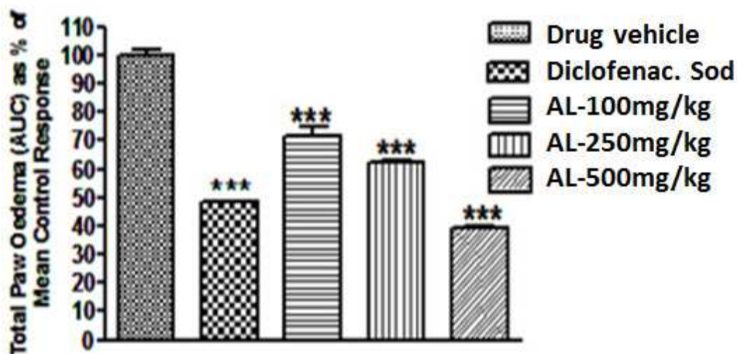
Fig 3: Effects of the methanolic extract of Alangium lamarckii 100, 250 and 500 mg/kg respectively along with standard- total paw oedema in Carrageenan induced rats ( P^{***} < 0.001 )

The Percentage inhibition of the total paw oedema with all the three different doses of Alangium lamarckii were 25.18 \pm 3.46 with 100 mg/kg, 37.46 \pm 0.56 with 250 mg/kg and 60.76 \pm 0.39 with 500 mg/kg against standard drug Diclofenac sodium 5mg/kg which produced 51.83 \pm 0.53 after 6 h. All these values were very highly significant and tabulated in Table 3 and shown in Figure 3.