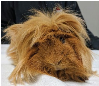
Figure 1 Clinical photograph, right tympanic membrane with opaque discoloration.