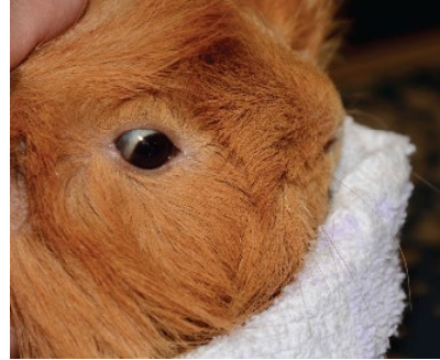
Figure 2 Clinical photograph, left tympanic membrane.

nervous system disease. Diagnostic imaging was recommended, but declined in favor of empirical treatment for otitis media. The patient was started on sulfamethoxazole-trimethoprim (Aurobindo, East Windsor, New Jersey, 08520, 15 mg/kg PO, BID for four weeks).